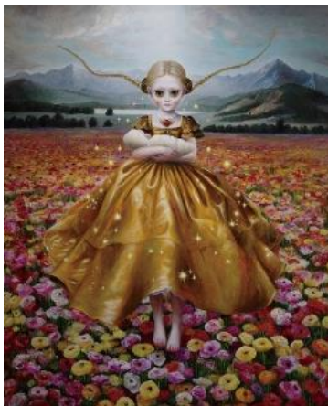
TOJINBARA Nozomi, Encounter / The Girl Who Fell from the Sky , 2023, Oil on canvas