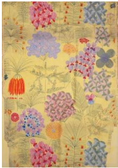
Felice [Lizzi] RIX-UENO, Wall paler , c.1962, Ink on paper