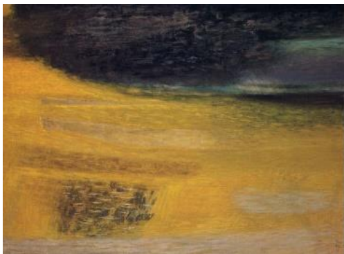
AKINO Fuku, Monsoon , 1969, pigments, glue-based paint on cotton