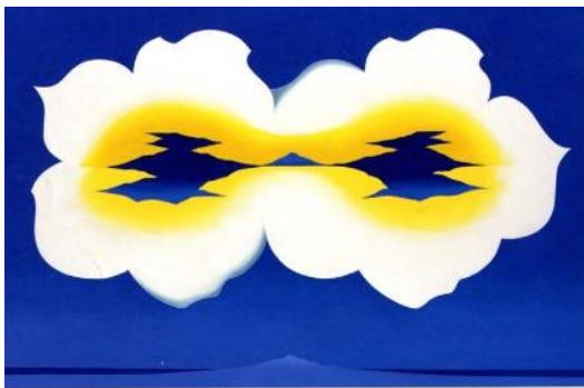
OGUSHI Sachiko, Untitled , 1997, Oil on canvas