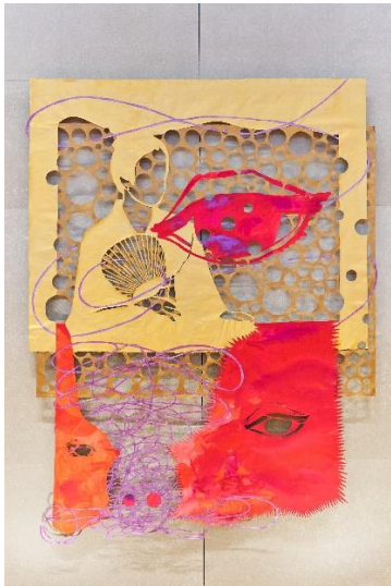
TANIZAWA Sawako, Female Image Exercises , 2024, Acrylic on paper